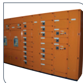
Motor Control Centre